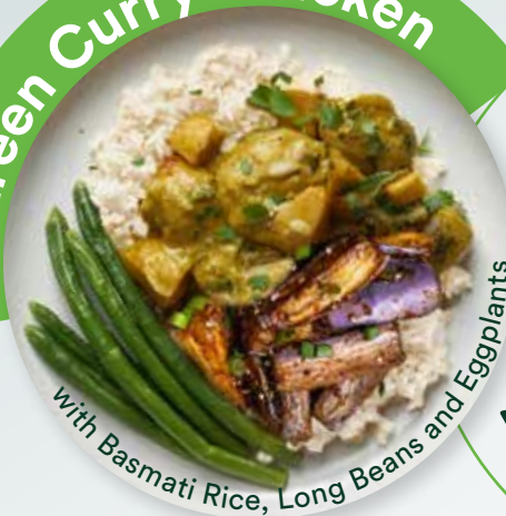
with Basmati Rice, Long Beans and Eggplants