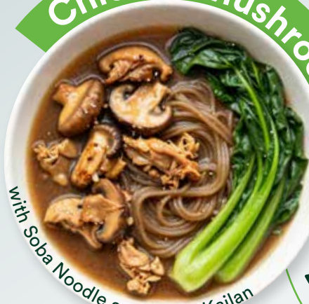
with Soba Noodle and Garlic Kailan