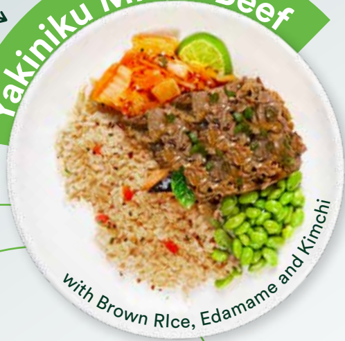
with Brown Rice, Edamame and Kimchi