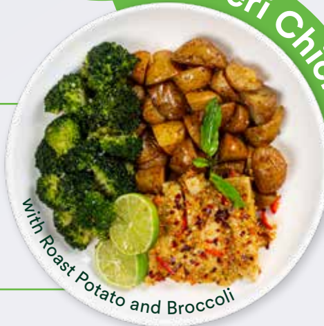
with Roast Potato and Broccoli