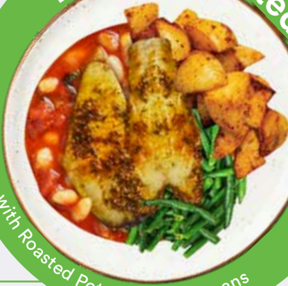
with Roasted Potato, French Beans