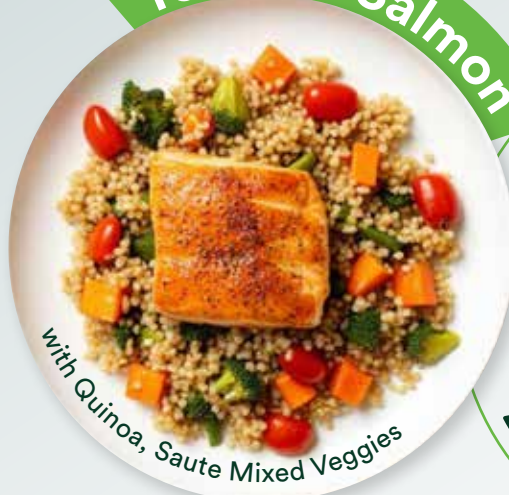
With Quinoa, Saute Mixed Veggies