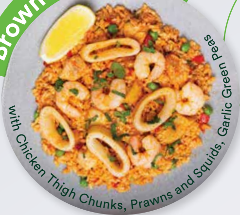
with Chicken Thigh Chunks, Prawns and Squids, Garlic Green Peas