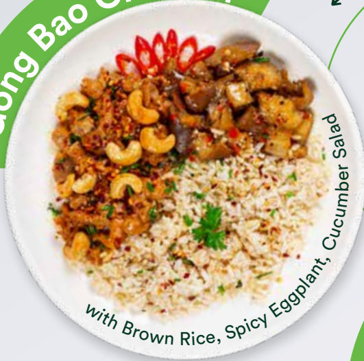
with Brown Rice, Spicy Eggplant, Cucumber Salad