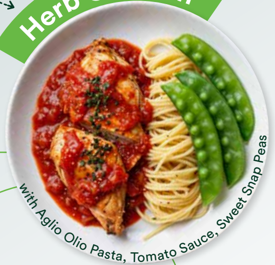
With Aglio Olio Pasta, Tomato Sauce, Sweet Snap Peas