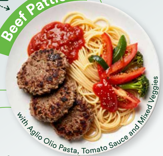
with Aglio Olio Pasta, Tomato Sauce and Mixed Veggies