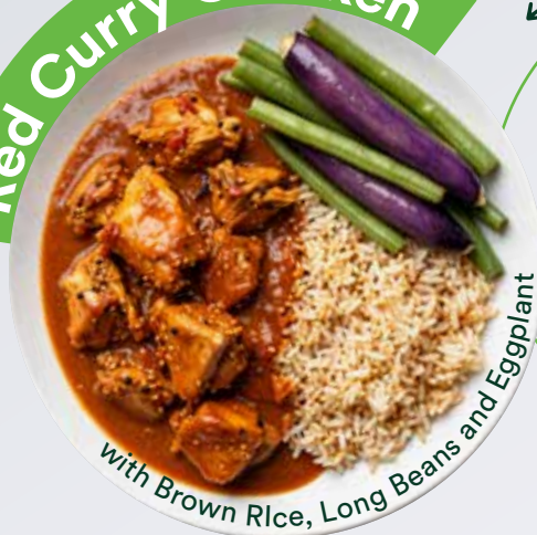
With Brown Rice, Long Beans and Eggplant