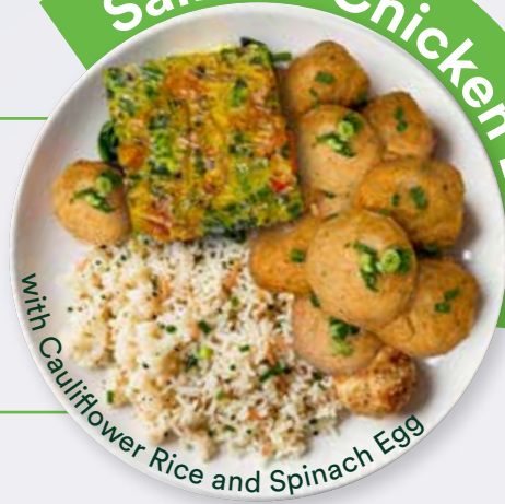
With Cauliflower Rice and Spinach Egg